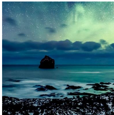
The Northern Lights