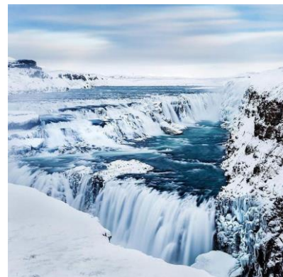
Gullfoss waterfall in winter