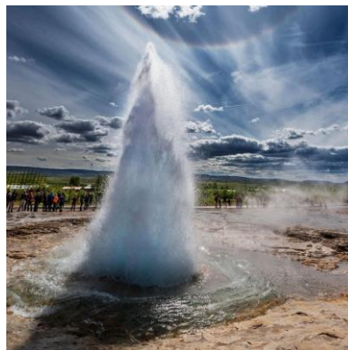
Geysir hot spring