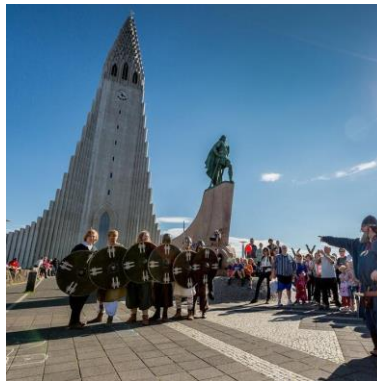
Hallgrímskirkja church in Reykjavik & harbour