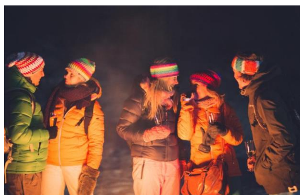
Have a drink at the campfire