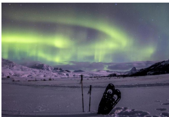
Try snowshoe walking!