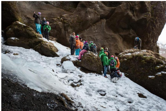
Hiking in Þorsmörk