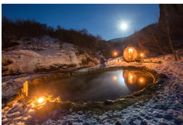
Cozy evening – go Sauna!